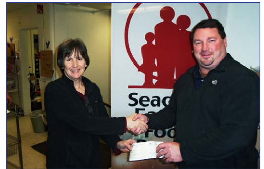
Thanks for the many generous food donations at the lodge which we delivered to the Seacoast Food Pantry, along with a check for $2,000 due to the shortage at the Food Pantry. To say they were more than grateful would be an understatement!