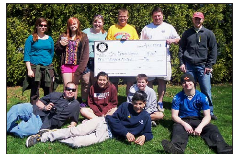
The Chase Home youths helping with the spring cleanup.