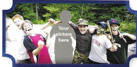
MAKE NEW FRIENDS